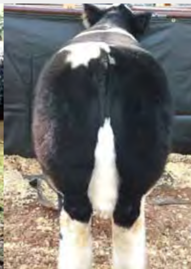
Cross Breds Denver USA