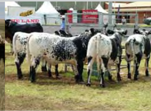
On the rail, Dubbo NSW