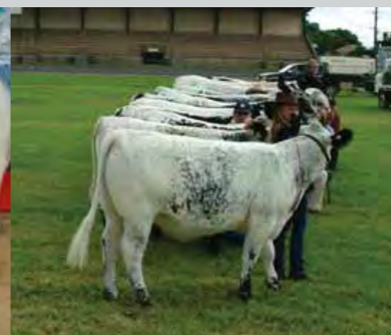
In the show ring, Dubbo NSW