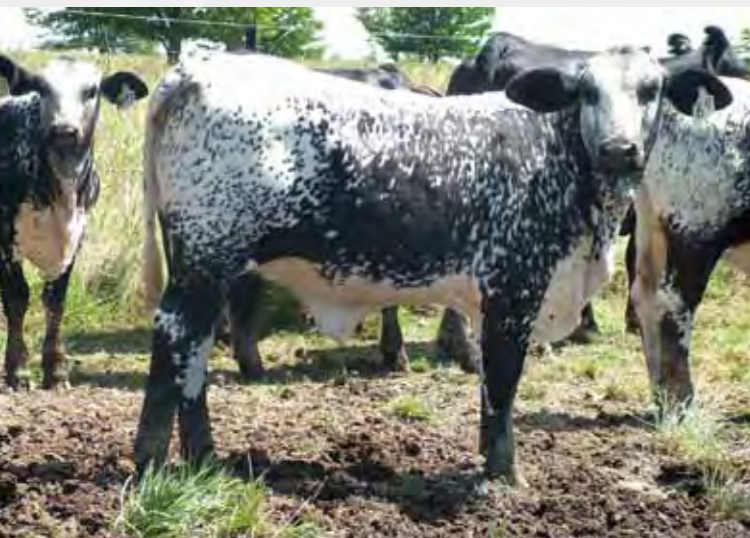
Brahckle - Brahman X Speckle Park