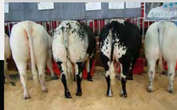
In the stalls, Dubbo NSW