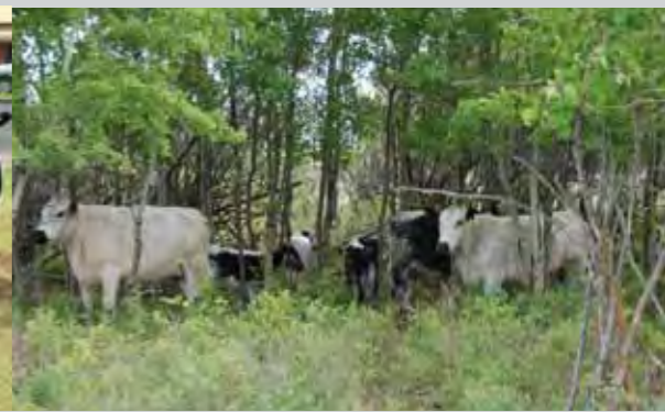
In the woods, Saskatchewan, Canada