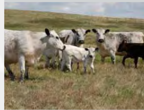
On the ranch, Canada