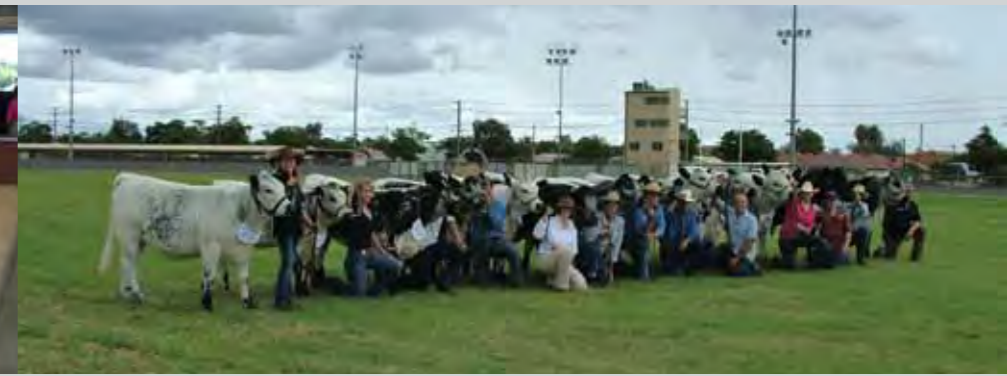
NSW Beef Spectacular Dubbo