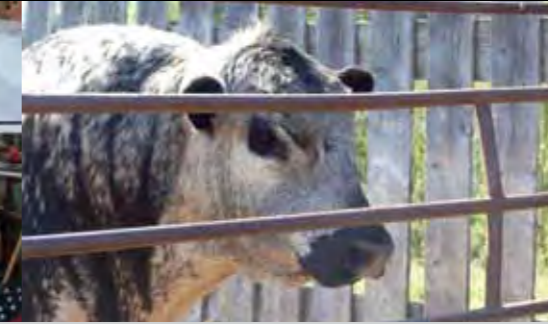
Looking out in Canada