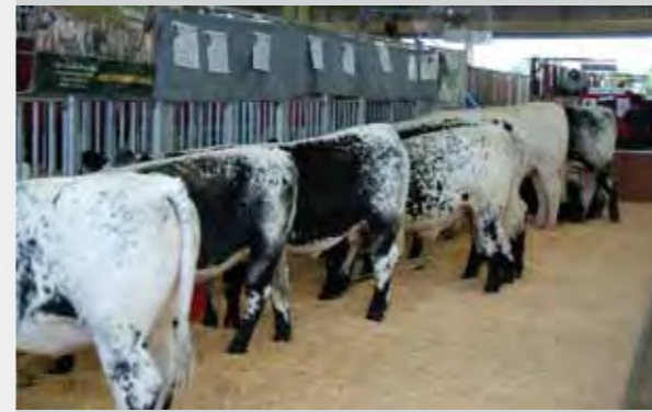
NSW Beef Spectacular Dubbo