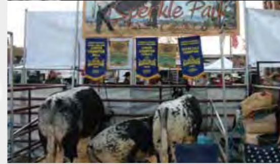
Denver Stock Show Colorado USA