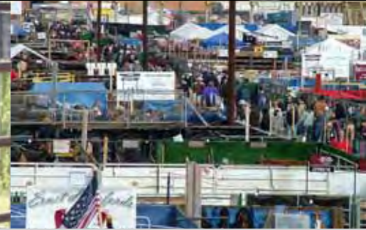
Crowd at Denver Stock Show